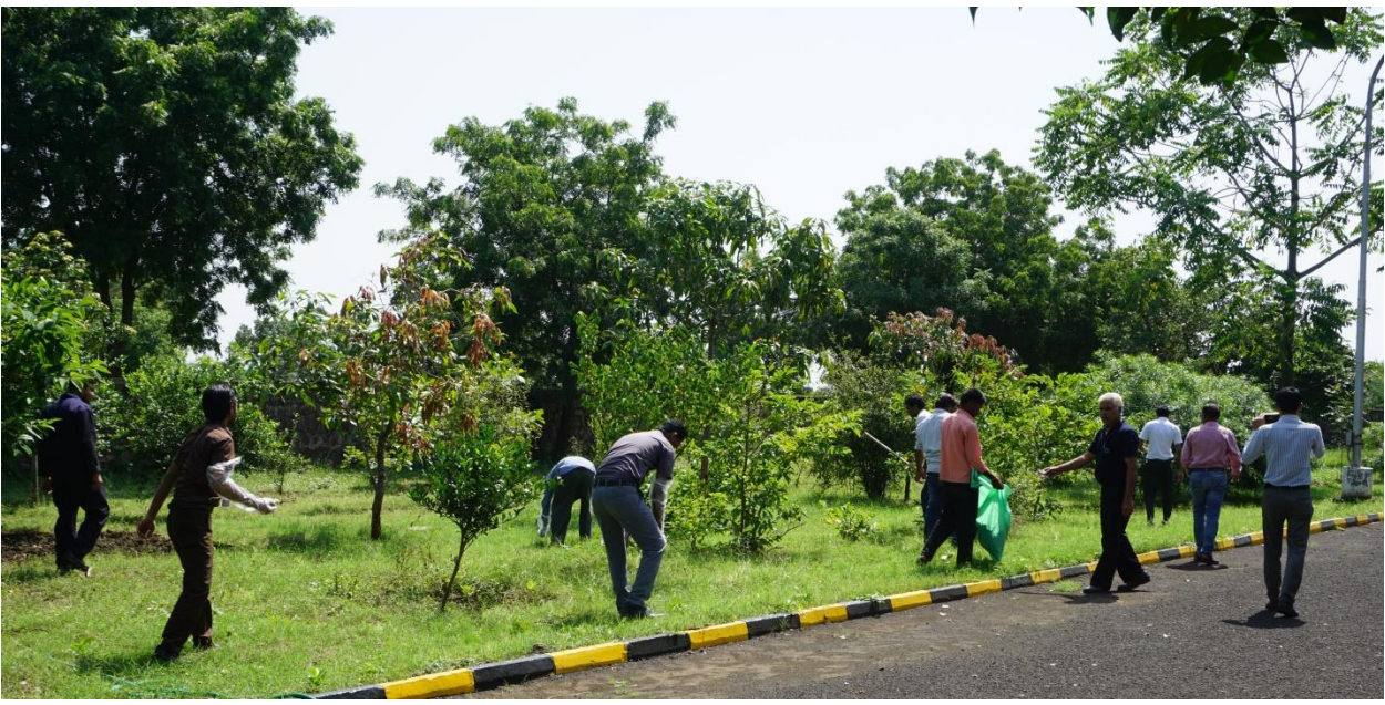
Cleaning the in and round areas of institute's engineering section